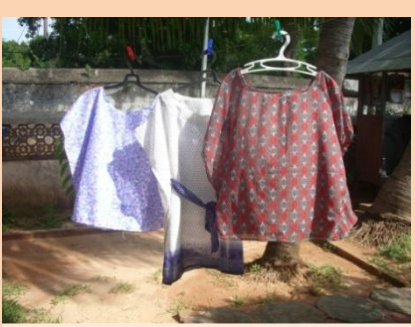
Blouses made by women!