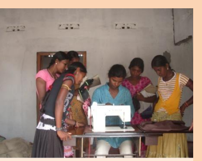
Sewing class in Uduthulai, Vadamarachchi east