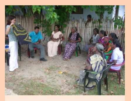
Meeting with the women in Manatkaadu,Vadamarachchi east

We are working with 13 women from 2 villages in Jaffna at this moment. We organized the women's group with 6-7 women in each village in April of this year. All of them were already given the sewing machines and have gotten the basic sewing trainings by PARCIC and other agencies. They have been working as tailors at home but their income is neither stable nor enough for their daily life. Their monthly income from sewing work is SLR. 1000-5000. Only in the big festival time such as Deepavali, they can earn more. They sincerely wish to improve their sewing technic and earn more income through this project. Therefore, since this May with a great motivation, women have started to improve their sewing technic with teacher employed by PARCIC.